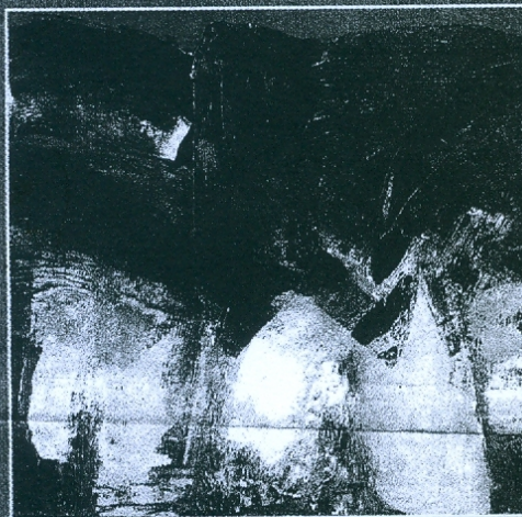
Discordant contrast: Crashing waves set against a calm blue sky.